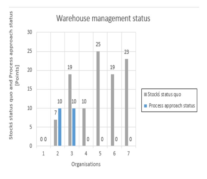
Figure 1. A warehouse management status in organisations.

The overall evaluation of all of above-mentioned characters for each organisation by the scale indicated by these characters by authors of this article is shown in Figure 1. The second column in some organisations means the level of the process approach in the organisation with respect to other known knowledge (determined by own created the methodology of one from authors).