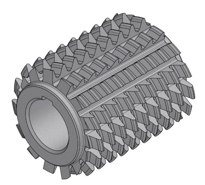
Fig. 3: Graphic output 3D model automatically generated from CAD program T Flex CAD (cylindrical right hand double pass hob cutter with hole, with 15 cutting grooves and with left hand sense).