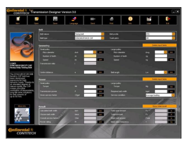
Figure 4. Program ContiTech Suite

The calculation results with all details can be saved, printed and sent in the PDF format by via e-mail.