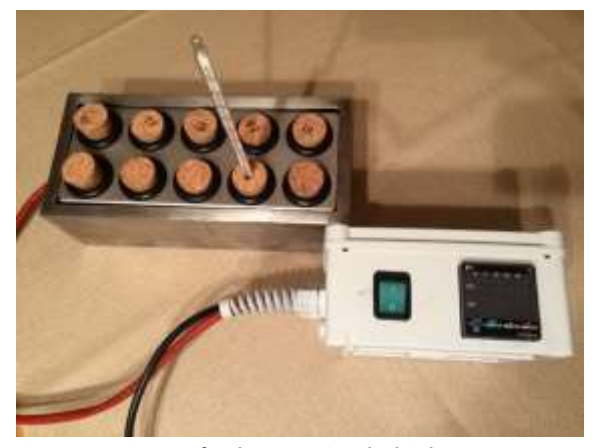
Figure 3. Equipment for the extraction the binders

In special solution of the solvents with low controlled temperature you can remove more than 50% of binders. This can decrease the time for the firing process for 30%. See equipment with small chambers for the dental crowns on figure below.