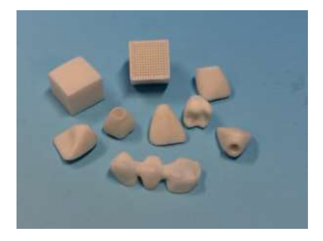
Figure 5. Printed and fired parts for bio applications