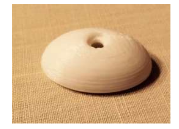
Figure 8. Proto of printed the human small joint design Prospon

Targets of our works were done, the first one material and technology of extrusion to build the flexible ceramic filament were tested and switch in serial. The second was to adapt standard rep-rap printer for the material is use. As well included tests of surface shades and material properties measurement.