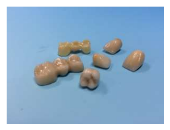
Figure 6. Printed and fired parts for bio applications with aesthetic layers-shades