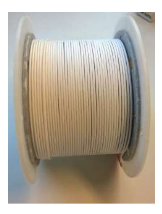
Figure 1. Spool with filament of ZrO<sub>2</sub> Y-TZP ready to use

up on standard spool Ø10x5 cm. The filament has a diameter 1,8mm in variation +/-0,05mm.